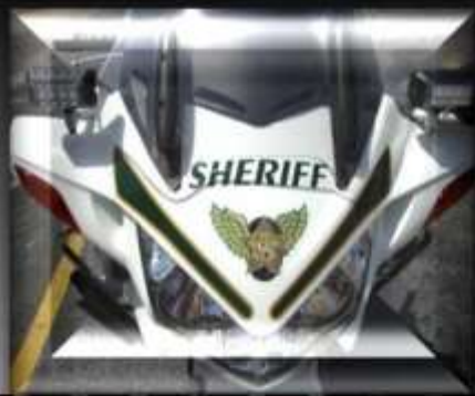
Escorted Ride By Brevard County Sheriff's.